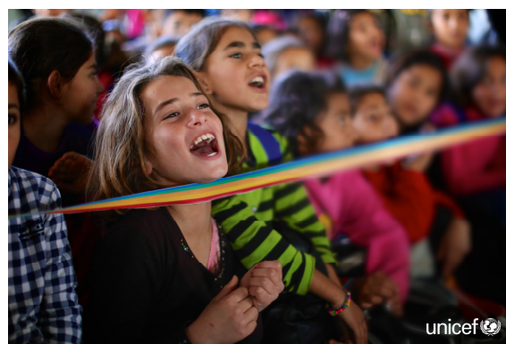
25th Anniversary of the CRC in Kawarogsk camp in a new school supported by UNICEF

In January 2015, UNICEF provided psychosocial support (PSS) to 728 children (374 girls; 354 boys) in multiple locations across the country. Children take part in recreational and social activities run by UNICEF and partners in child- and youth-friendly spaces (CFS / YFS) that allow children and young people to play, learn, and engage with their peers in a safe and constructive environment. CFS and YFS spaces give child protection actors a chance to identify children and young people who may need additional provision to support their growth and recovery. In January, 116 children (43 girls; 73 boys) received, or were referred to more specialised protection services. Cases included children exhibiting signs of psychosocial distress and disorders, non-attendance at school or cases of child labour.