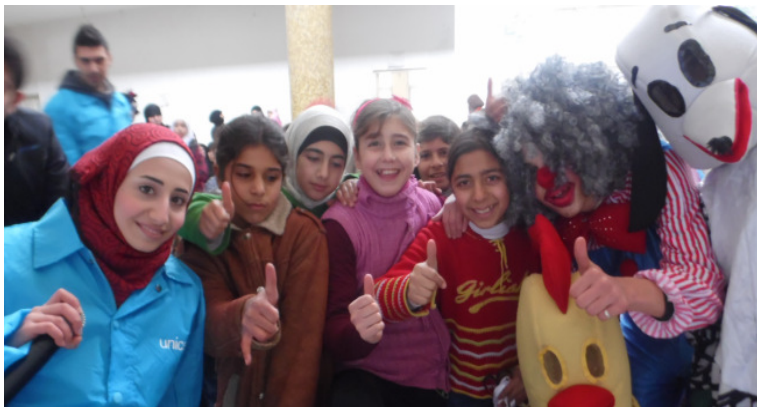
Aleppo, Syria.